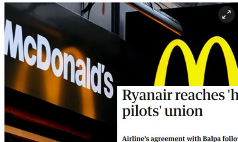
McDonald's has been one of the biggest users of zero

Staff in Cambridge and Grayford branches to protest over low wages and zero-hours contracts in action backed by Corbyn