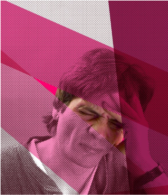
After a focal seizure, it is common to feel confused and have difficulty in speaking for a short time

If someone has epilepsy, it means they have a tendency to have epileptic seizures. Epilepsy is not necessarily a life-long diagnosis, and doctors may consider that someone no longer has epilepsy if they go without seizures for a long enough time.