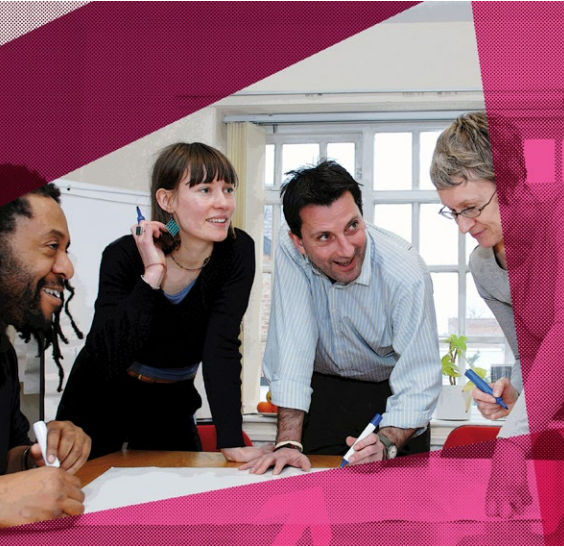
The experts on disability are disabled people; unions must listen to members with epilepsy when discussing adjustments they may need

The UN Convention on the Rights of Persons with Disabilities, Article 4.3, states that: "In ... decision-making processes concerning issues relating to persons with disabilities, State Parties shall involve persons with disabilities, including children with disabilities, through their representative organisations."