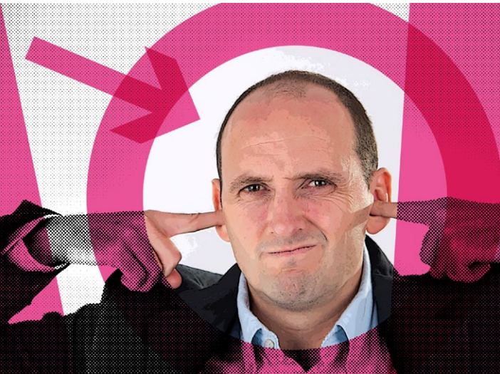
Using the wrong words can reinforce negative stereotypes

See the TUC briefing, Words Can Never Hurt Me? for a detailed explanation of how the choice of language can help or hinder our campaigning for disabled rights.