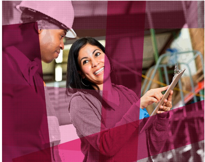
Risk assessments are designed to protect the worker with epilepsy and ensure they can carry out their tasks safely

Once the answers to these questions are known, an employer might need to make 'reasonable adjustments' to allow the person with epilepsy to start or continue in their role or to take part in training or a work placement. This is a requirement of the Equality Act (England, Scotland and Wales) and the Disability Discrimination Act (Northern Ireland). Financial support to fund reasonable adjustments might be available from Access to Work (see page 16).