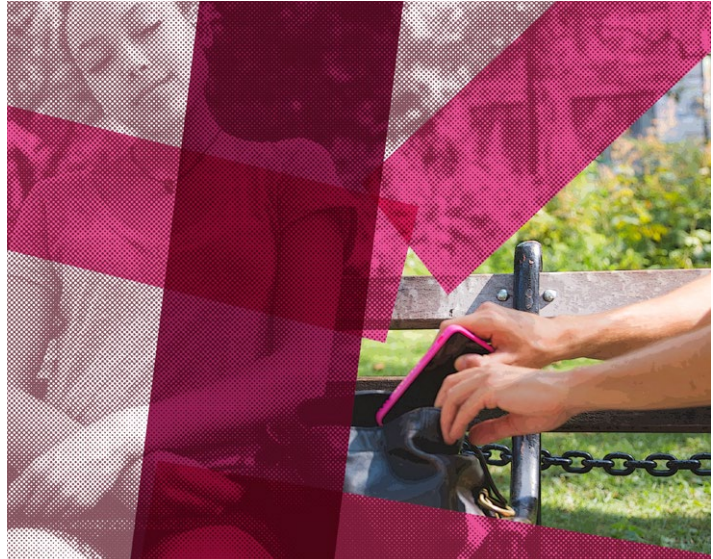
People with epilepsy have been victims of crime while having seizures

This was a callous and terribly sad case where a woman was taken ill just yards from her place of work, only to then become a victim of crime when she was defenceless.