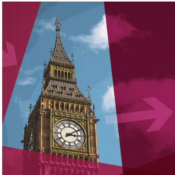
The All-Party Parliamentary Group on epilepsy has lobbied government for better services for people with epilepsy

The APPG has asked questions of government about public services for people with epilepsy and lobbied for change. In the past, it has conducted its own inquiry into the human and economic cost of the under-funding of epilepsy services in England. The inquiry resulted in written reports to lobby government for improved health care services for people with epilepsy. The evidence highlighted the main issues caused by poor service provision, including the influence of epilepsy on employment opportunities and education, as well as the social stigma.