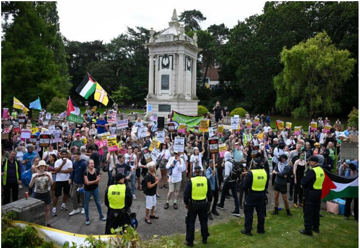
Bournemouth, Christchurch and Poole TUC anti-fascist protest, Summer 2024.