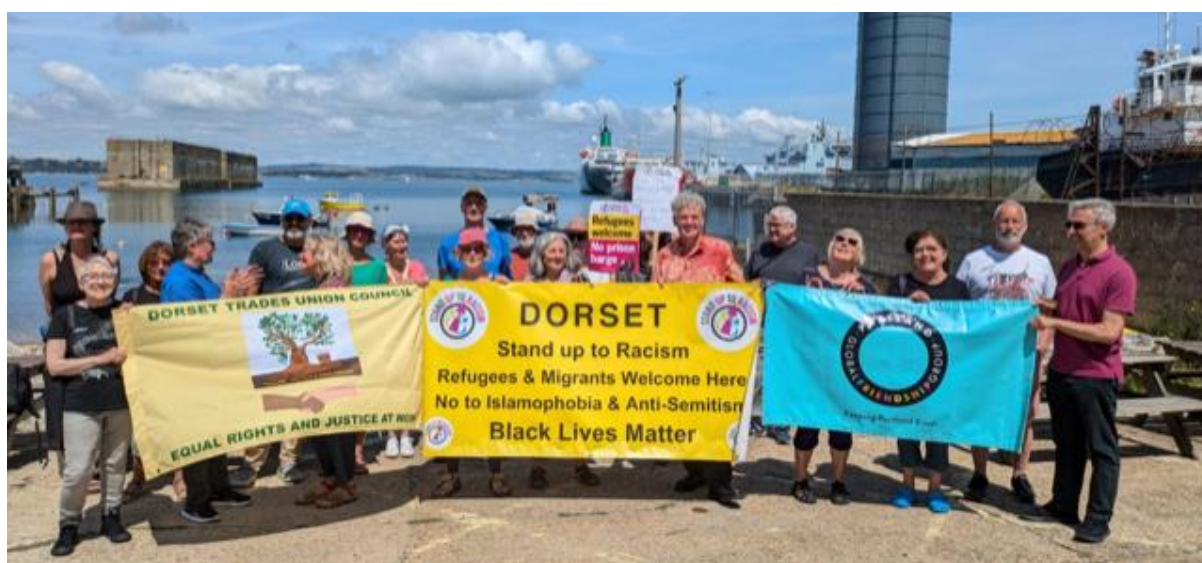
One of several demonstrations in support of the Bibby Stockholm Barge refugee residents, summer 2024

Throughout 2024 our developing strategy was to challenge the political agenda by campaigning directly to Dorset's community about years of economic and social decline. We publicised local Tory councillors' failure to persuade their own government to stop massive council funding cuts. Dorset TUC's General Election campaign publicised the negative impact of (then) MP Richard Drax's voting record on workers in Dorset. Recently, we are aiming to work with Bournemouth, Christchurch and Poole TUC for a Dorset-wide meeting to alert MPs to our concerns about Dorset's declining economy and lobby on key issues: economy, jobs; access to health/care services; transport; housing; education.