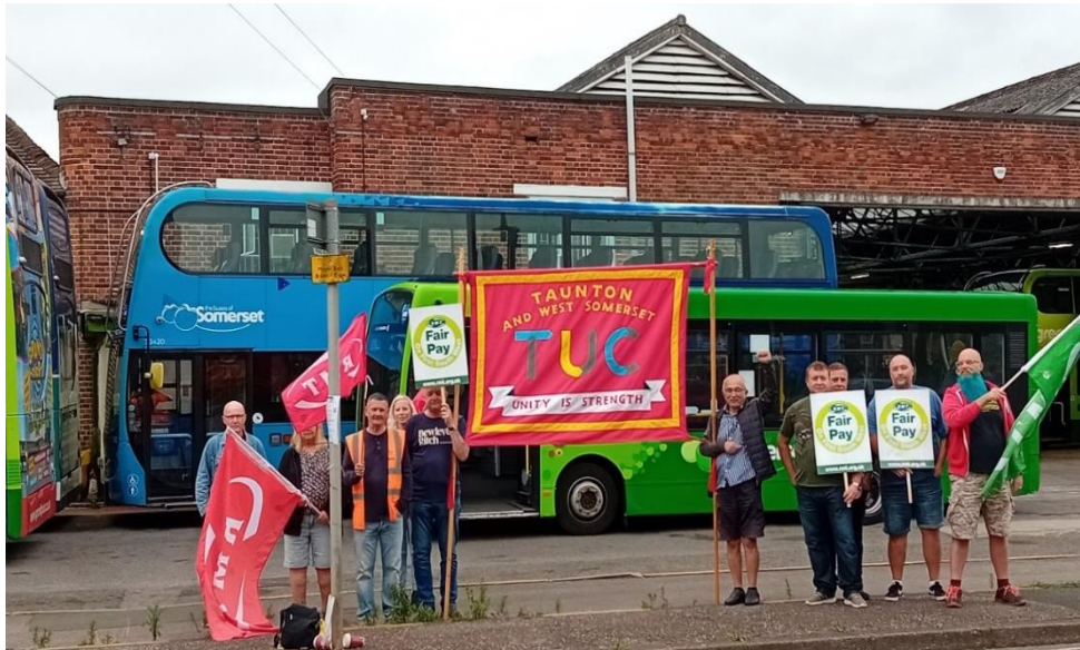
Taunton and West Somerset TUC activists and banner at the town' Bus Depot, supporting the RMT pay strike picket