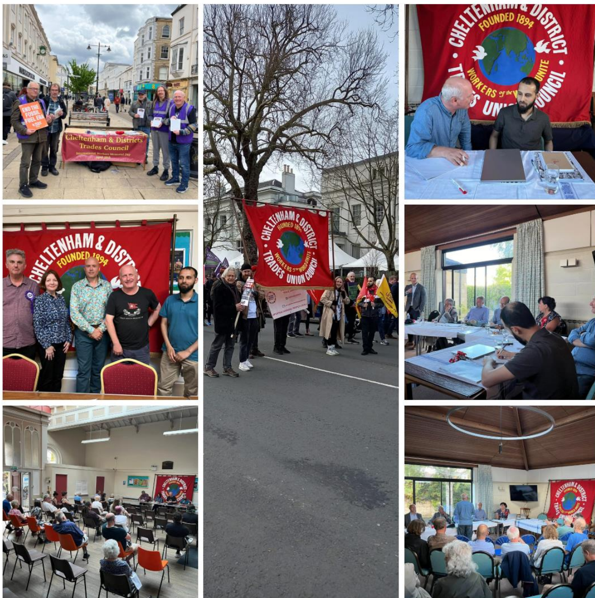
Cheltenham and District TUC's 2024 collage-nice one!

2024 started with 5,000 participating in the TUC demonstration against the Strikes (Minimum Service Levels) Act 2023 anti-union legislation, on Saturday 27th January in Cheltenham from 12 noon in Montpellier Gardens marching through the town centre to Pittville Park.