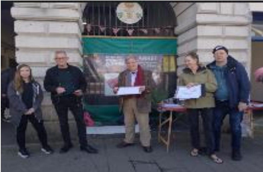
North Devon and Torrridge activists outside Barnstaple's Pannier Market

Promotional initiatives: Facebook: Our North Devon and Torrridge TUC Facebook platform has been a tremendous success story in twelve months of existence, with 156 followers, 593 reactions (90 days) and 149 engagements.