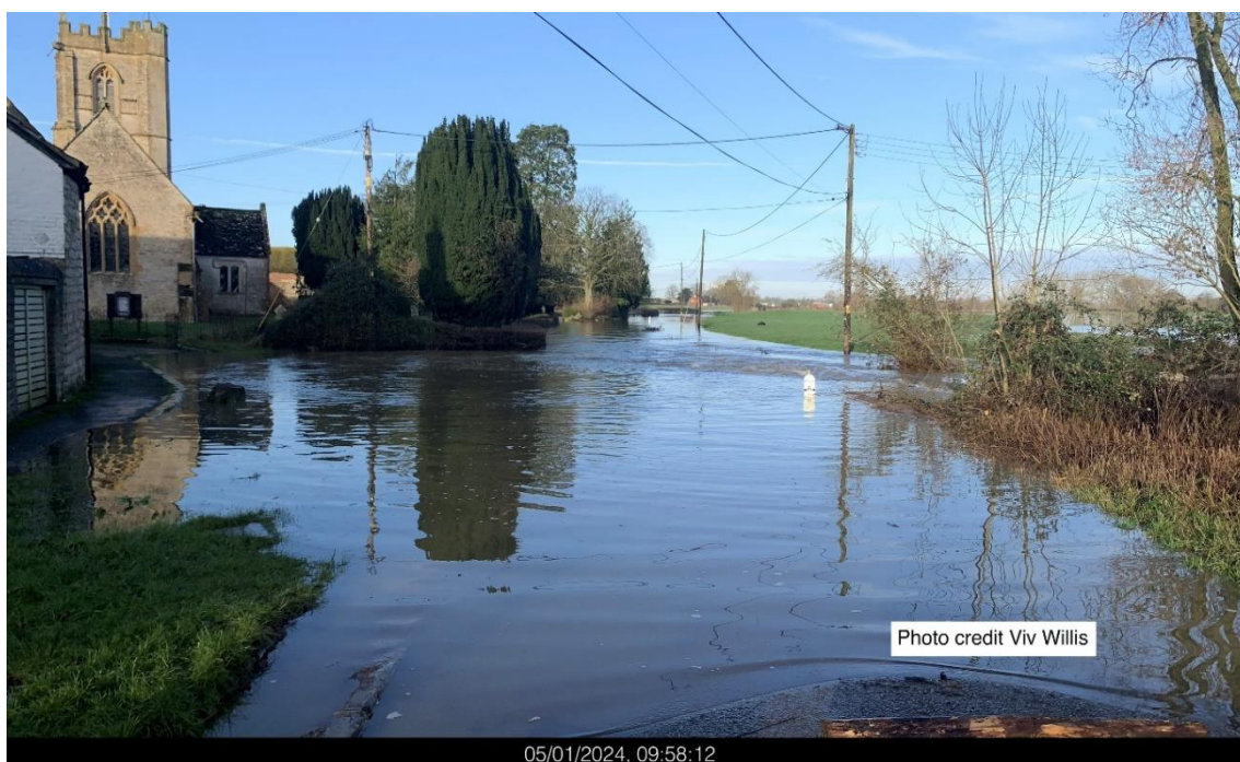
Mudford village, near Yeovil, flooded yet again in January 2024.