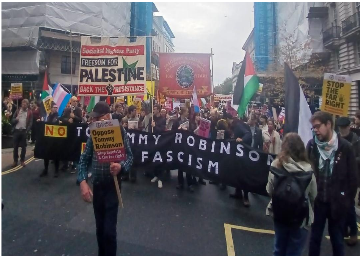
Salisbury and District TUC banner on a Anti-“Tommy Robinson” protest, central London, 2024

On International Workers Memorial Day, Salisbury City Council, at our request, followed through with their commitment to us to fly their flag at half mast, even if it was only in the foyer of the Guild Hall.