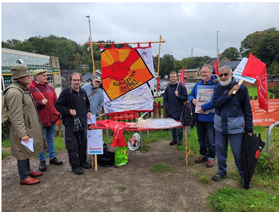
Gloucester and District TUC's activists and banner at 'Ecotricity' protest