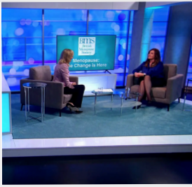
Menopause: The Change is Here - ITN Productions