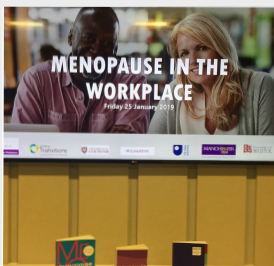
Menopause in the Workplace UK-wide events