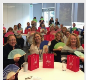
Severn Trent menopause awareness session