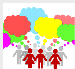
Video: Menopause in minutes