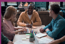
Union rep One

Online courses, freely available to all union reps, are a great way to learn at your own pace. Learn where you want, when you want - on a smartphone, tablet, laptop or desktop computer. You will find it easy to track your progress and pick up right where you left off.