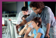
Learning rep 2

eNotes are short online courses to help reps keep up-to-date on key workplace issues. There are more than thirty eNotes to choose from there's something to interest everyone.