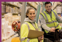
Health & Safety