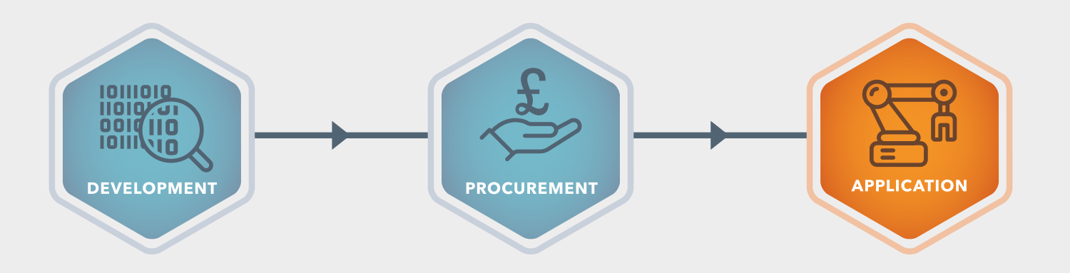
FIGURE 2: The AI value chain