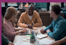
Union rep One

Online courses, freely available to all union reps, are a great way to learn at your own pace. Learn where you want, when you want - on a smartphone, tablet, laptop or desktop computer. You will find it easy to track your progress and pick up right where you left off.