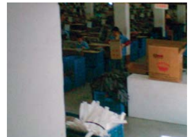
Stacks of flammable fabrics on the shop floors

In Block B, for instance, there is a cutting room on every floor. The main purpose of the cutting room is to cut the large pieces of fabric and other textiles. Workers complain about the dust and fluff from the various materials flying all over the place in these rooms. The factory does not offer the workers any protective gear. If a worker wants to wear a mask, she must buy it herself.