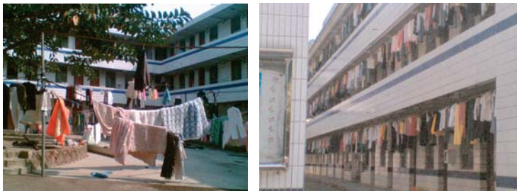
A 3-storey workers dormitory

Workers find the quality of the food and accommodation at YWC satisfactory. However, they complain that the charge for food at 120 yuan a month is too high. For that fee, the factory cafeteria provides just two meals a day. Workers who choose to eat outside the factory are not charged for food, but the cost of eating outside is higher.