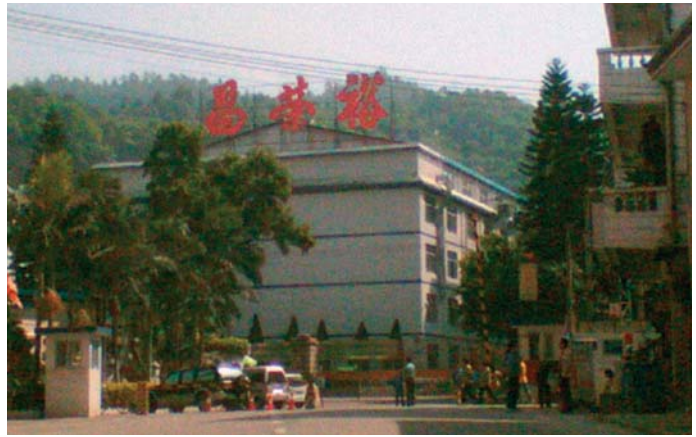
The bag manufacturing plant based in Longgang District, Shenzhen

YWC's manufacturing complex in Shenzhen is very large, consisting of five factory buildings, Blocks K, A, B, C, and D (with about 3,000 production machines), and a 3-storey dormitory, canteens, a clinic, recreation facilities (a library, basketball field and pool table) and convenient stores.