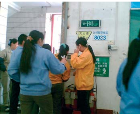
A very small number of fire extinguishers on site in the plant

In these sewing workshops, there are stacks of flammable fabrics, but there are inadequate fire extinguishers. The workers have not had any fire safety training, and if there were a fire, the results could be disastrous, PlayFair was told.