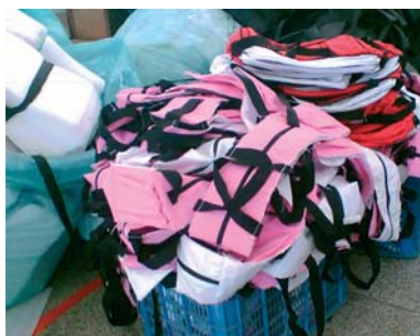
Women workers sewing bags