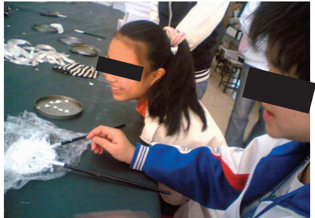
Primary and secondary school students employed at Lekit during the school holidays (A PlayFair researcher worked alongside them in January 2007).

Lekit Stationery Co., Ltd. established in 1977, is an ISO 9001 certificated manufacturer of paper and leather products. PlayFair conducted its research at one of its manufacturing facilities in Dongguan in Guangdong province.