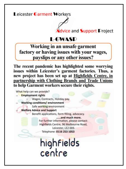
L-GWASP project poster

Over the past year it has become apparent that this complicated, thorny issue of exploitation and intimidation within this sector cannot be solved solely within the workplace. differing communities within Leicester, build trust and secure safe spaces for exploited individuals.