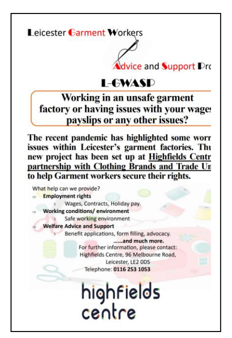
Highfields Centre L-GWASP poster

through the effective links we are forging with the unions, so that matters of remediation etc can be successfully followed up.