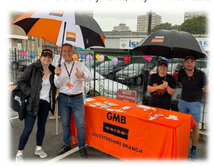
GMB and Missguided at the Highfields Festival, Summer 2021

When unions identify issues, they will raise issues with the supplier as in any ordinary