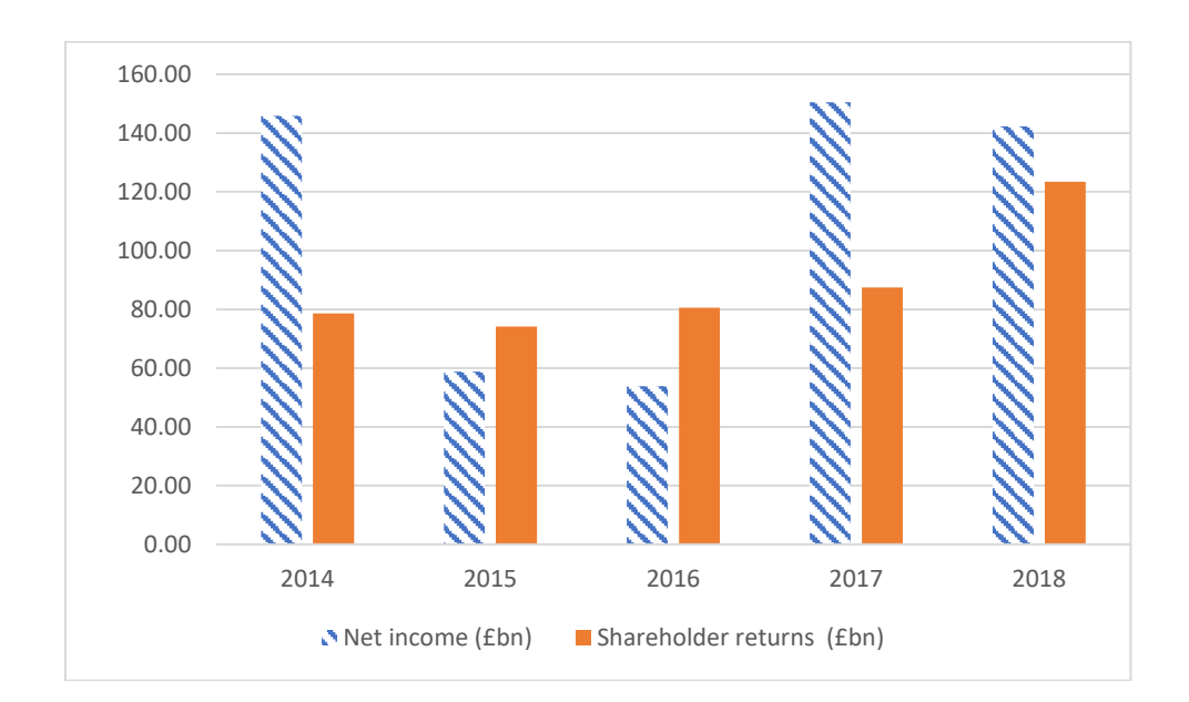
Figure 1: Total profits and returns to shareholders